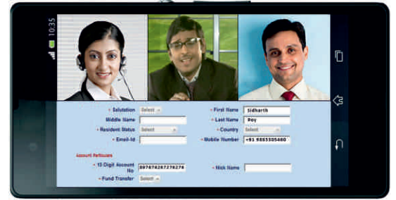
Vennfer Video Banking multi-party escalation calls on mobiles