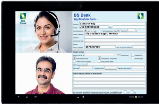
Vennfer Video Banking on tablets with data