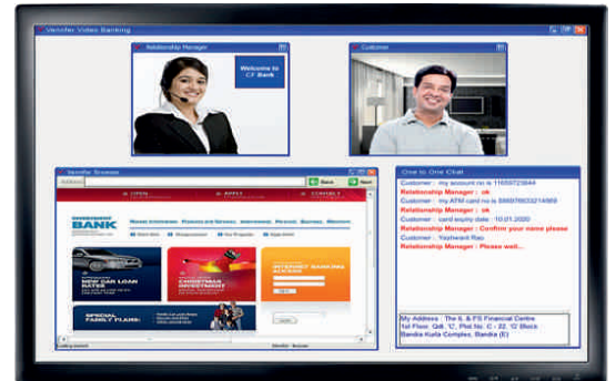
Vennfer Video Banking with data collaboration service on PCs