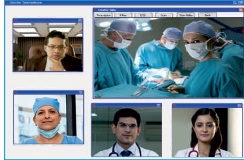
Tele - presence (Remote assistance in surgery)