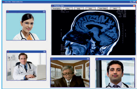
Tele - consultation (Direct clinical, preventive, diagnostic, therapeutic, treatment, consultative & follow-up services)