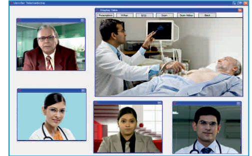
Tele - monitoring (Remote monitoring of rehabilitation services)